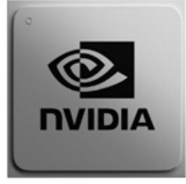
NVIDIA Spectrum-4 ASIC